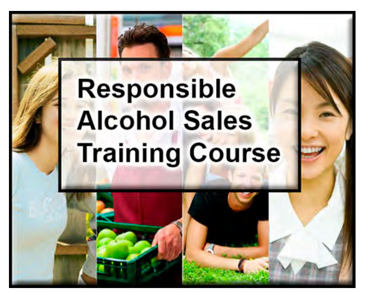
Online Responsible Alcohol Sales Training Course home page.