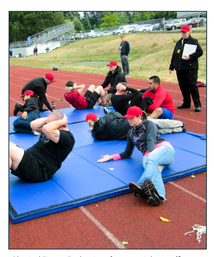
Physical Fitness Evaluations for potential new officers

The FDA Tobacco Inspection Program is comprised of 10 staff who maintain FDA-commission credentials and conduct tobacco inspections at licensed tobacco retailers in Washington State.