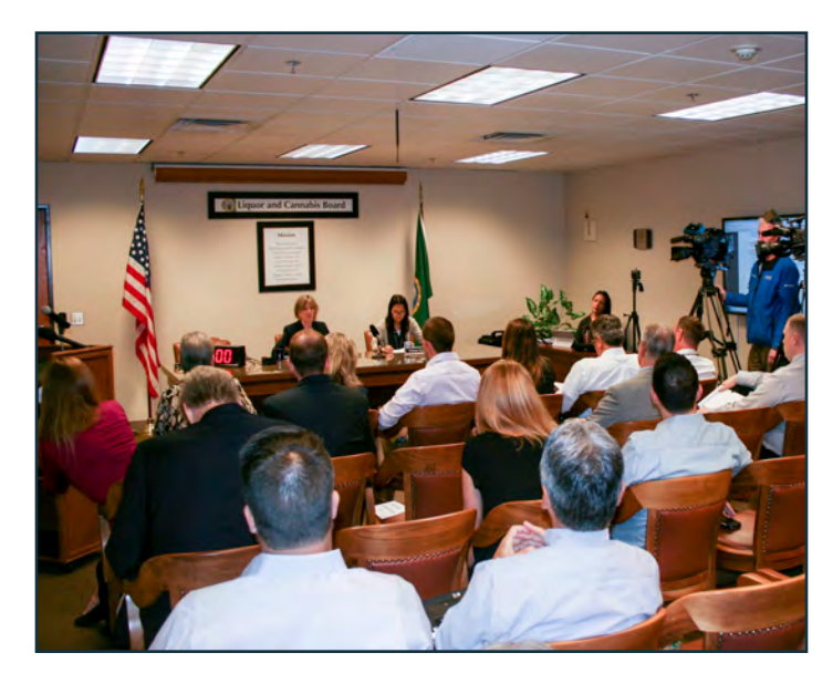
Board meeting regarding warning symbols on marijuana packaging