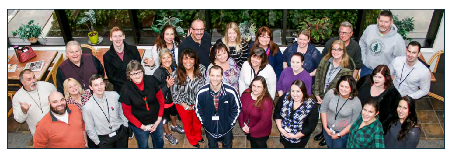
Marijuana Licensing Unit

The Customer Service Unit responds to over 3,000 phone calls a month, issues permits for special occasions, raffles and other events where alcohol is served. In FY 2016, the Customer Service Unit issued 5,923 special occasion licenses and permits. It also assisted the licensing units to process more than 18,000 marijuana and liquor licenses.