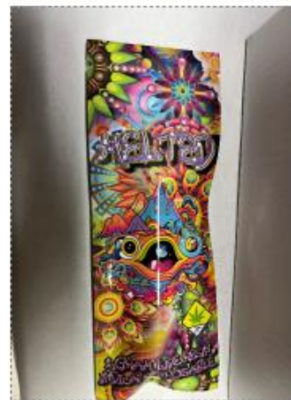
Some of the more than 200 cannabis items seized as evidence

Law Enforcement Use Only – Do not disseminate without permission of the Washington State Liquor and Cannabis Board Information Sharing Group. Contact – Jessica.Petteys@lcb.wa.gov